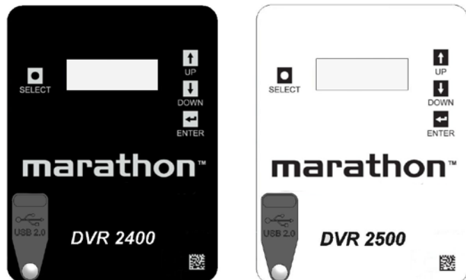
Figure 2. DVR2400 voltage regulator and DVR2500 voltage regulator HMI Shown

The digital voltage regulator HMI consists of four buttons and a four-character LED display as illustrated in Figure 2. The display indicates status conditions and parameter settings. Button function descriptions are given in Table 5.